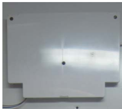
Figure 2 (Cover installed)